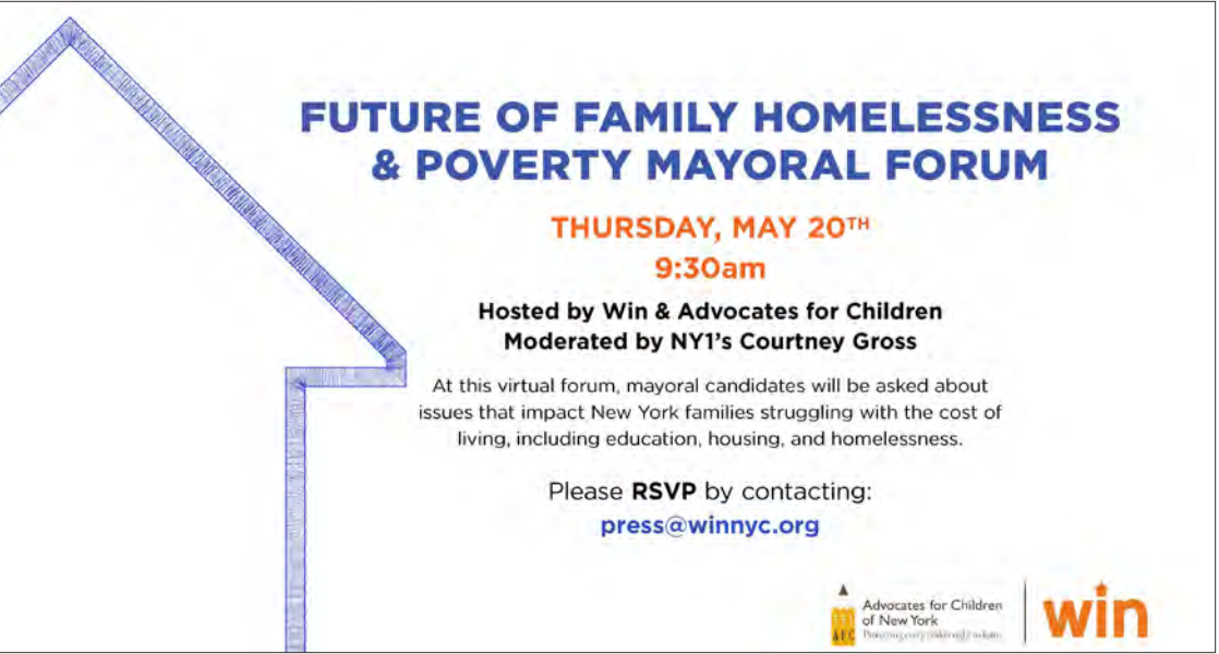
Invite for Win’s Future of Family Homelessness & Poverty Mayoral Forum